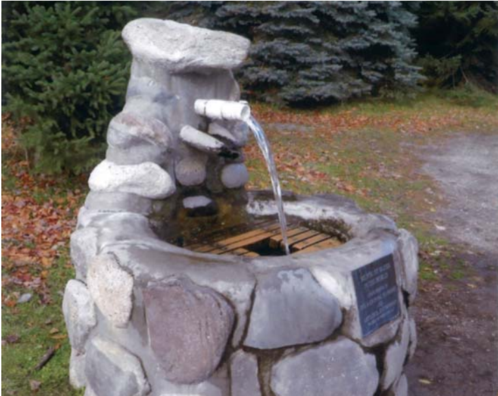
A natural spring fountain in Alanson, MI

Literally every physical thing in existence can help us learn about God and teach us lessons from God. This physical-spiritual connection was designed by God to help us know Him, have a relationship with Him, and understand the spiritual realm. The spiritual realm would be impossible to understand without the physical realm in which we exist. The water flowing from natural springs and fountains is a classic and very important example of this.