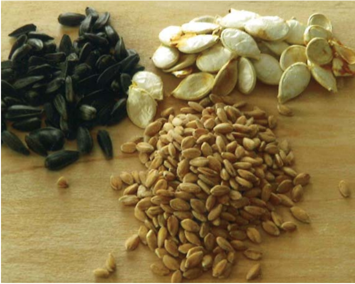
l-r; Sunflower, Wheat and Squash

Seeds are arguably the most amazing things in all creation. Seeds have the power to impart life to another generation. This is so remarkable because in the universe all physical things are moving toward a state called entropy. According to the American Heritage Diction of the English Language , entropy is “the tendency for all matter and energy in the universe to evolve toward a state of inert uniformity.” When living things die, they have moved into a state of entropy, the cessation of life’s energy. When no more electrical impulses can be detected, we use the term “flatlined.” Seeds defy the law of entropy!